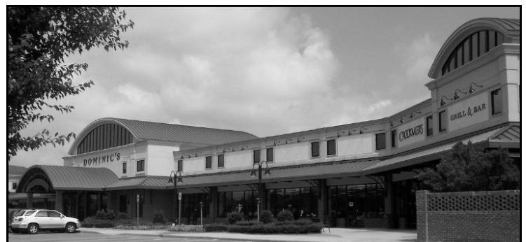
The new home of Pike Road Town Hall on Vaughn Road

The Town of Pike Road already has plans to create a cultural park at the site of the current Town Hall, with the Pike Road Volunteer Fire Department slated as one of the site's future occupants. An additional fire station at the corner of Pike and Meriwether Roads will result in lower ISO ratings for area residents and, in turn, a higher level of fire and rescue service and lower homeowners insurance premiums.