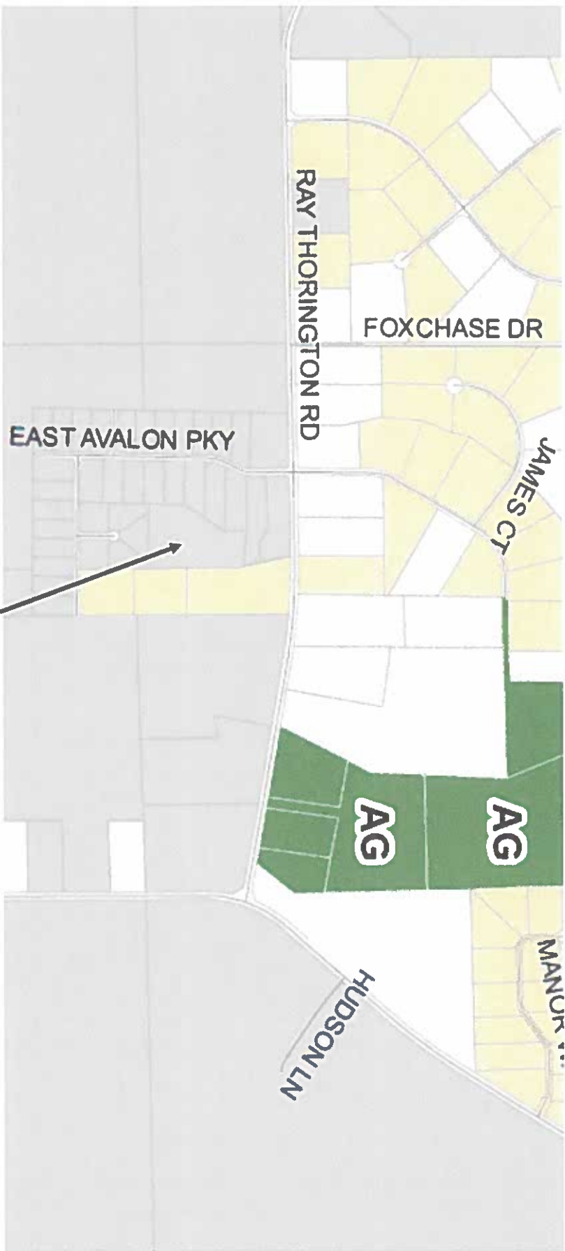
EXHIBIT A DATE : 8-13-18