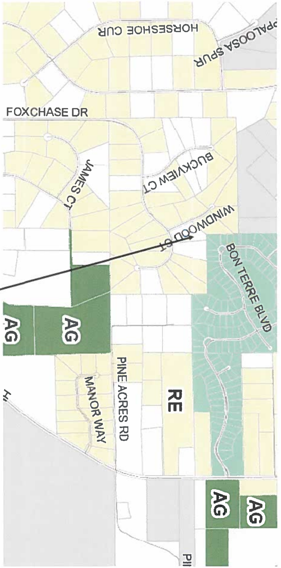
EXHIBIT A DATE : 2-11-19