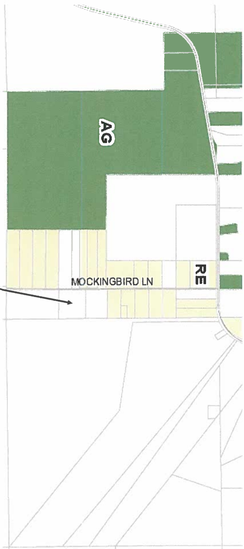
EXHIBIT A DATE : 3-11-19