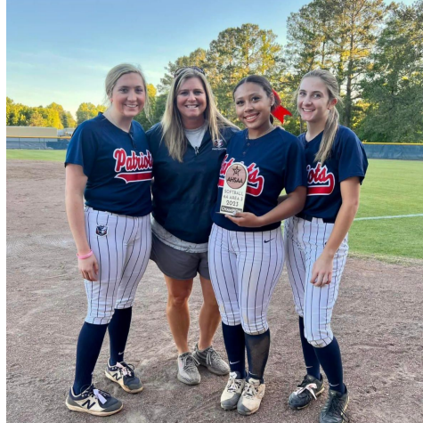
Pike Road Patriot Softball players are celebrating after winning the Area Championship! These ladies will go on to the AHSAA South Regionals later this month.