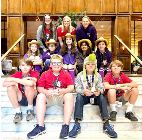
Several Pike Road Robotics teams traveled to Dallas last week to compete in the VEX IQ World Championship!