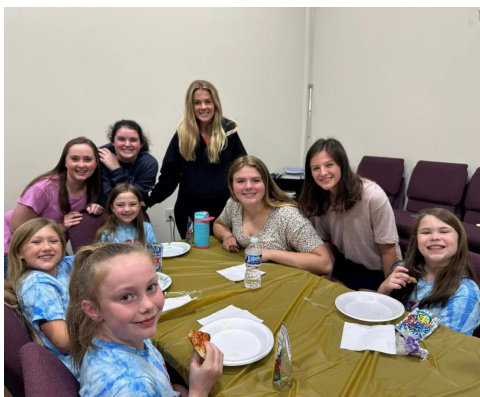
The Pike Road High School Show Choir recently hosted students from the Elementary School for a day of song, dance, and pizza!