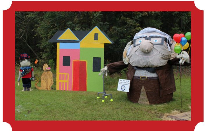
1st Place Neighborhood Winner - 2018 Bridle Brook Farms