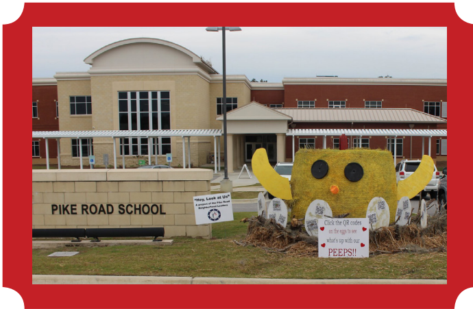
1st Place Business/Organization Winner - 2018 Pike Road Elementary School, Founding Campus