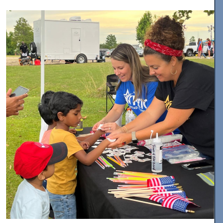
Temporary tattoos & glow sticks were a hit at SummerFest!