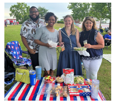
Picnics and food trucks are all part of the fun at SummerFest!