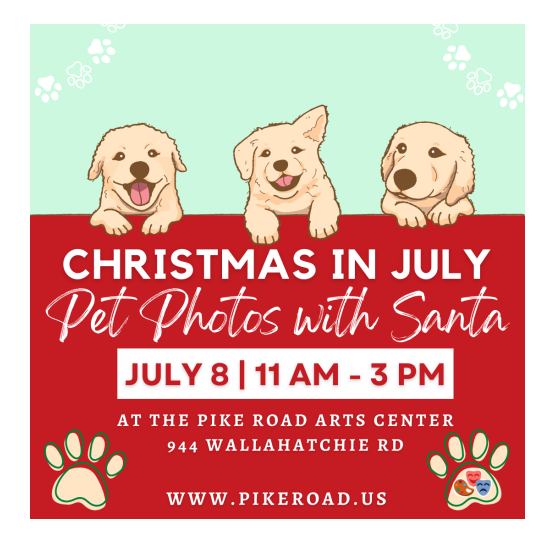
July 8: Santa Claus Visits the Town of Pike Road for Christmas in July

Santa Claus is coming to town! <u>Celebrate</u> <u>Christmas in July</u> with your furry friends Saturday, July 8 from 11 a.m. - 3 p.m. while they get their portraits made with Santa at the Pike Road Arts Center. This free photo opportunity is perfect for getting a head start on your Christmas cards! This event is presented in partnership with the Montgomery County Humane Society. Donations will be accepted.