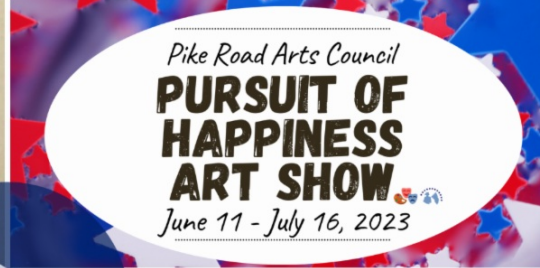
at the Pike Road Arts Center, 944 Wallahatchie Rd